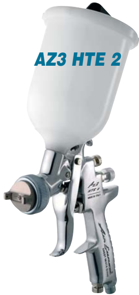
AZ3 HTE 2