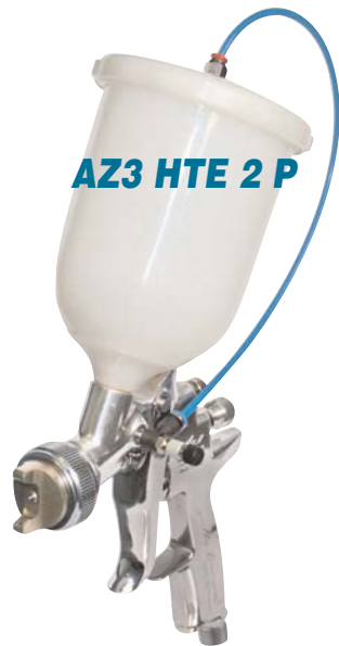
AZ3 HTE 2 P